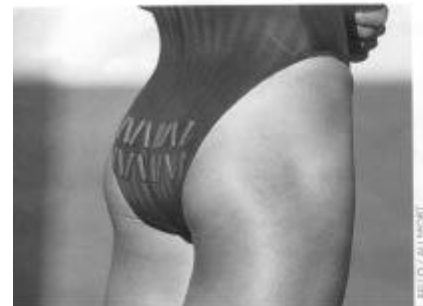
BEILO / ALLSPORT

** results were not posted at time of departure from Edmonton